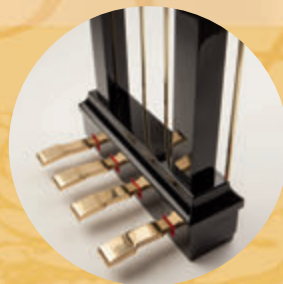
Pédale Harmonique for all grand pianos