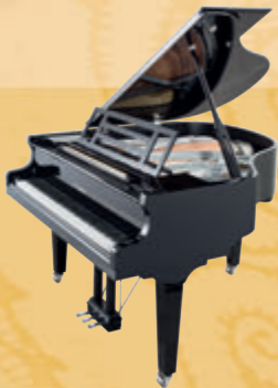
Mod. 162 - Dynamic I