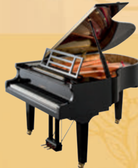
Mod. 179 - Dynamic II