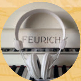
Silencer Systems for all models