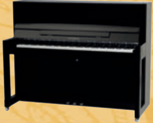
Mod. 115 - Premiere