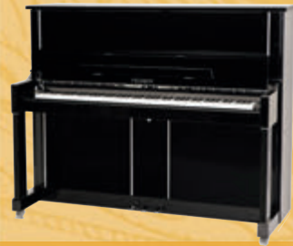
Mod. 125 - Design