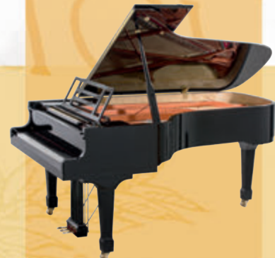
Mod. 218 - Concert I