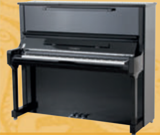
Mod. 133 - Concert