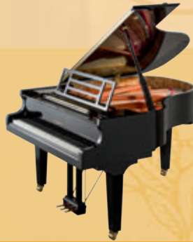
Mod. 179 - Dynamic II