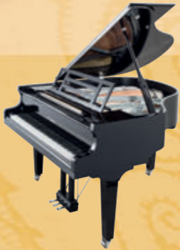
Mod. 162 - Dynamic I