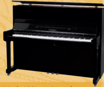
Mod. 122 - Universal