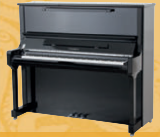
Mod. 133 - Concert