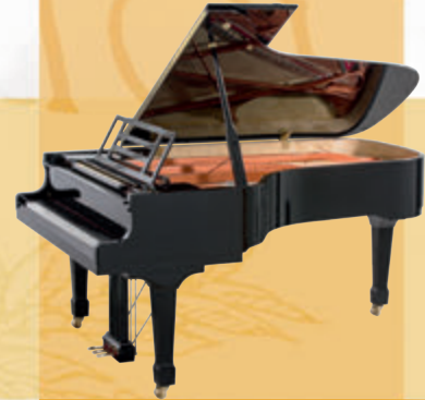
Mod. 218 - Concert I