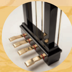
Pédale Harmonique for all grand pianos