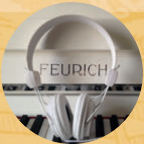
Silencer Systems for all models