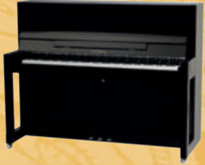
Mod. 115 - Premiere