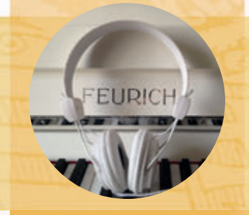
Silencer Systems for allI models