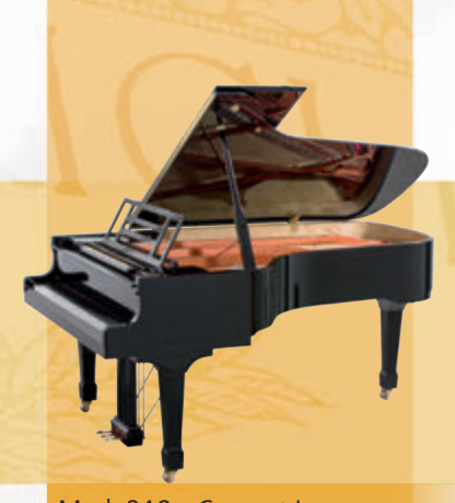
Mod. 218 - Concert I