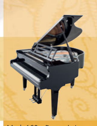
Mod. 162 - Dynamic I