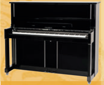
Mod. 125 - Design