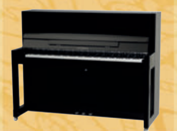
Mod. 115 - Premiere