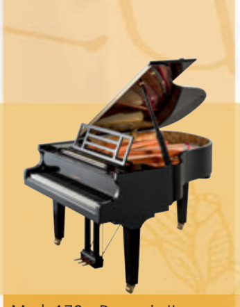
Mod. 179 - Dynamic II