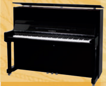
Mod. 122 - Universal